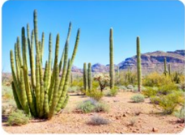
Cacti grow in desert habitats.

Plants are living things that change with the seasons. They grow in different habitats.