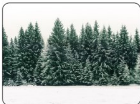
evergreen trees in winter