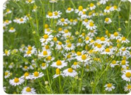
Daisies grow in meadow habitats.