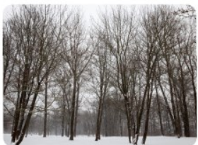
deciduous trees in winter

Trees can be deciduous or evergreen. Deciduous trees lose their leaves in autumn and have bare branches in winter. Evergreen trees shed old leaves and grow new leaves all year round, which means they